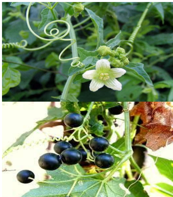
Figure 1. Leaves and Fruits of Bryonopsis alba